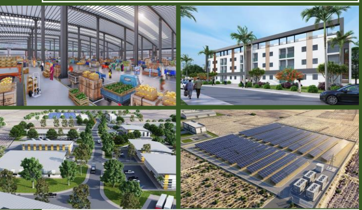
01 Assembly Market ,Shop House, Warehouses & Cold Storage and Solar Farm