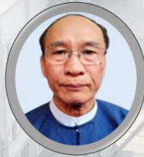
U MIN SEIN