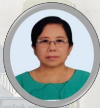
DAW TIN MAY OO CHAIRMAN NOMINATION COMMITTEE