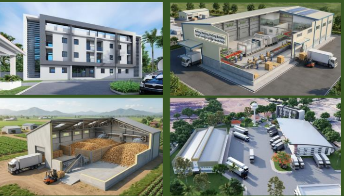
02 Shop House, Cold Storage and Sorting, Washing, Packing