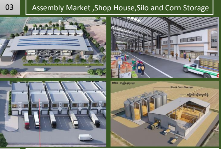
03 Assembly Market ,Shop House,Silo and Corn Storage

By eliminating inefficient middle-tier layers, we establish a direct pathway from farm to market—benefiting local growers and domestic consumers alike. Moving forward, we are committed to implementing contract farming to scale regional production up to international export standards, paving the way for foreign currency generation and future expansions into other fertile agricultural zones.