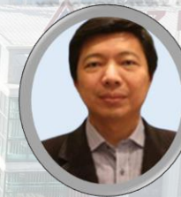
U PHONE PHONE NAING