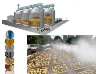
New Warehouse Buildings