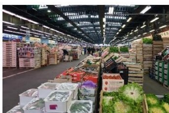
New Wholesale Market

The follow visions are set out for the development of this project.