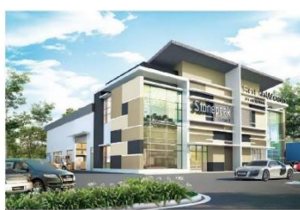
New Trader Offices